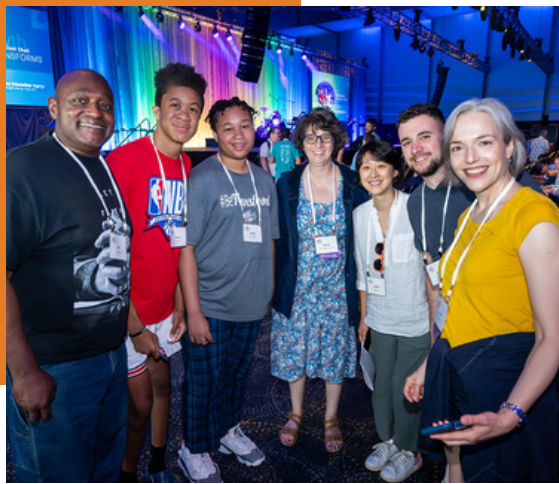
EXHIBIT HALL DATES & HOURS

Exhibits will be located on the third-floor pre-function area of Joseph S. Koury Convention Center.